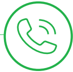
Automated, unsolicited calls and voicemails