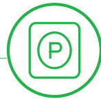
Waiting in parking lots