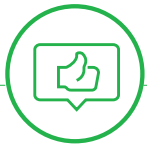
Facebook and Twitter ads