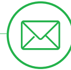
Letters sent to associates